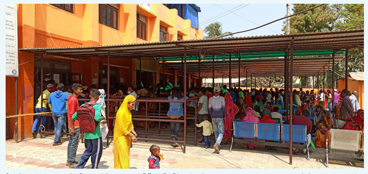
People queuing up at the District Administration Office (DAO) in Janakpur to receive various services, including passports. Most of the people that apply for passports are potential migrant workers who are provided with free counseling services by the Migrant Resource Centre at the DAO premise before the passports are issued.